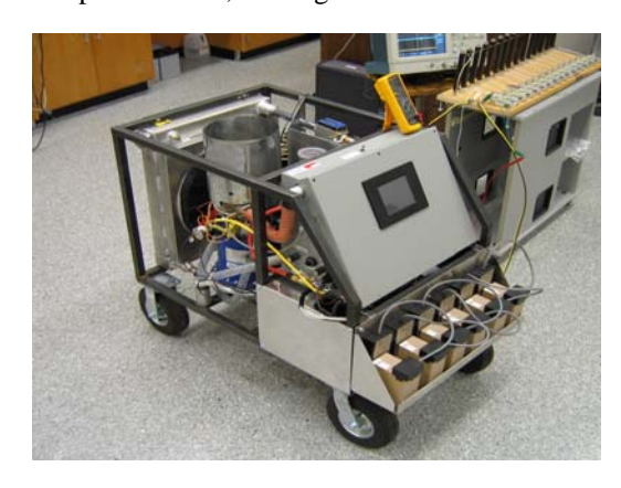
FIGURE 5. Stand-Alone, 1.2 kW Stirling Convertor Battery-Charging Power System.

The reactor output temperature will be a significant issue in developing a reference design. As noted above, the low-temperature design requirement has been selected to obviate the need for superalloys for the Stirling convertor, and enable use of Inconel 718 that has been in common use in these convertors. Because of cost issues, the nominal 5 kW SCA to be developed in this first effort will be operated at temperature consistent with Inconel 718. The most important issue to be resolved in this