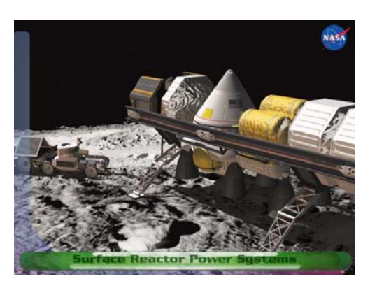
FIGURE 1. Lunar Nuclear Surface Power Concept.

The primary energy issue arises when stay times in excess of 14 days are envisioned. For locations other than at the poles, the 14-day long night poses challenges for an energy storage system connected to traditional solar arrays. Past studies have shown that a solar array/regenerative fuel cell system is exceptionally massive – weighing 5880 kg for a 20 kW (3.4 W/kg) system. (Kohout,