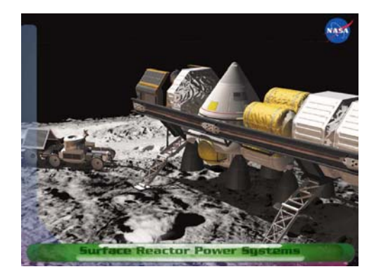
Figure 1. Lunar Nuclear Surface Power Concept

The primary energy issue arises when stay times in excess of 14 days are envisioned. For locations other than at the poles, the 14day long night poses challenges for an energy storage system connected to traditional solar arrays. Past studies have shown that a solar array/regenerative fuel cell system is exceptionally massive - weighing 5880 kg for a 20 kW (3.4 W/kg) system. (Kohout, 1989) On the other hand, dynamic conversion systems powered from thermal sources have been shown to be potentially lighter at about 100 W/kg. (Brandhorst, 2005) Thus there is a significant opportunity to develop new, larger free-piston Stirling convertor systems to meet future NASA needs. The options for lunar surface nuclear (fission) power systems continue to evolve. Placement of the fission power plant ranges from lander-based to locations remote from the lander. One option is shown in figure 1. (Cataldo, 2005) the power plant may be stationary or mobile. A stationary plant has lower mass and risk but requires precision