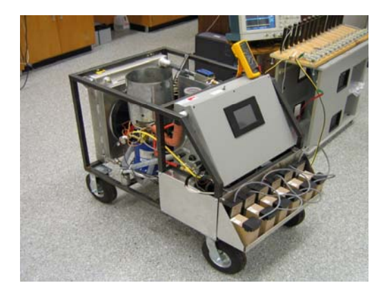
Figure 5. Stand-Alone, 1.2 kW Stirling Convertor Battery Charging Power System.

The reactor output temperature will be a significant issue in developing a reference design. As noted above, the low-temperature design requirement has been selected to obviate the need for superalloys for the Stirling convertor, and enable use of Inconel 718 that has been in common use in these convertors. Because of cost issues, the nominal 5 kW SCA to be developed in this first effort will be operated at temperature consistent with Inconel 718. The most important issue to be